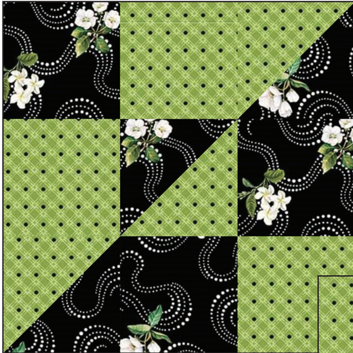
Blocks shown in Bouquet collection DP23090-99 & 23095-74